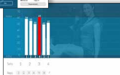
Smart 7" Tablet included